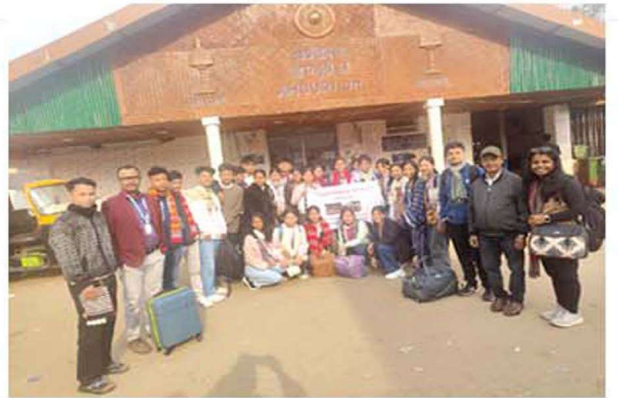
Dimapur, Nagaland Political Science Dept.