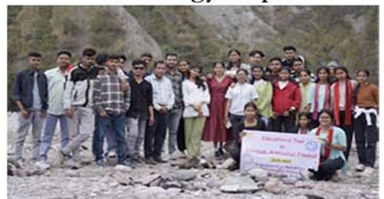
Dambuk, Arunachal Pradesh