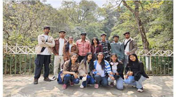
Shillong, Meghalaya History Dept.