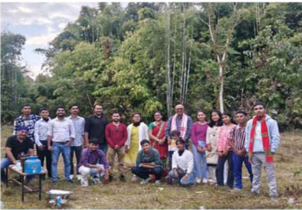
Nagajanka Eco Park, Jorhat